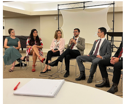
Students at Patriot's Academy participate in mock legislature (below) and panel discussion (above).

engage the culture. Two students were able to attend the Forge Leadership Summit in Ohio, an equipping event training young conservatives to lead in politics and culture. And finally, two students traveled to Wycliffe Hall Summer School in Oxford, England. Wycliffe Hall is working to see the nations transformed by the gospel by equipping a generation of ordained and lay leaders with gospel-centered knowledge, character formation, and pastoral skills. We are sowing the seeds for a brighter tomorrow!