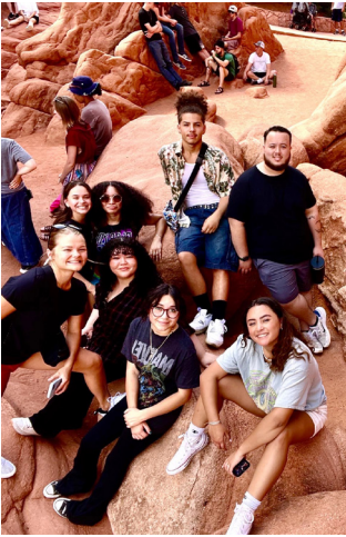
Summit Ministry students enjoy nearby Garden of the Gods in Colorado.

Every year, we are thrilled to sponsor youth scholarship programs that build up and encourage the next generation. This year was no different. Over the summer, we had the privilege of sending sixty-one enthusiastic teens and young adults to pivotal events that will undoubtedly shape their futures. In June, Patriot Academy's Southeast Leadership Congress provided an immersive experience that equipped thirty-five students with vital leadership skills, fostered a deep understanding of civic responsibility, and ignited a passion for positive change within their communities. In July, eighteen students attended Summit Ministries Student Conference where they delved into comprehensive worldview training. Summit fosters thought-provoking discussions and seeks to develop a solid foundation rooted in biblical principles. We sent four students to Teen Pact in Tallahassee, which is designed to help younger students understand the political process, value their liberty, and