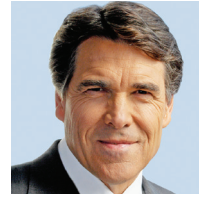
Rick Perry Governor