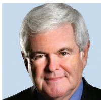
Newt Gingrich Former Speaker

Check out our new website www.FLfamily.org