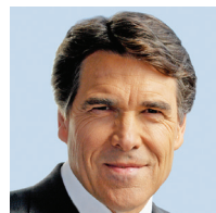
Rick Perry Governor