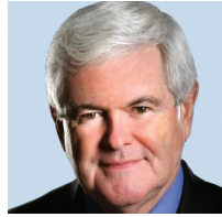
Newt Gingrich Former Speaker