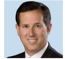
Rick Santorum Former Senator