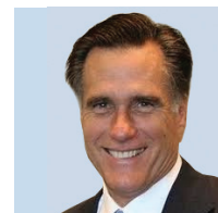
Mitt Romney Former Governor