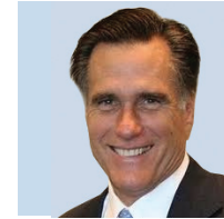
Mitt Romney Former Governor