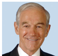
Ron Paul Congressman